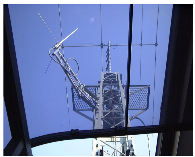
morsEAsia Page - 4 - January, 2006