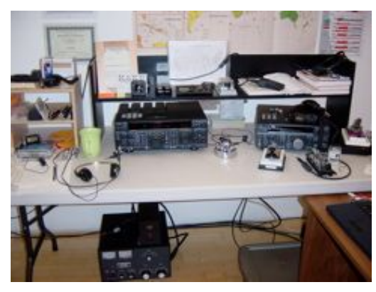
K6KF San Jose

My recent interest is how much I can improve my CW skills of having chat in English by head-copy. What is challenging the most to me is not head-copying itself but keying words in a non-native language. It is not easy to pick out an ideal and natural expression for the situation on the fly. I think this is a lot more difficult than speaking verbally. It would be a long way to master, but it's interesting to feel my skills improving little by little.