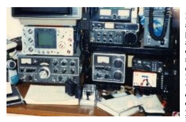
My Shack in 1987

My ham life started when I was eleven in 1979. An English teacher at my middle school who was a ham and enjoying chatting with people on the air showed me how interesting the bobby was. I spent a couple of months to pass the exam and got a ticket with JM1JOT. I don't remember who the very first station I worked was, but I do remember that I was so nervous that my voice was shaking and couldn't speak normally. I chose 6m to start. My first radio was an RJX-610. The 6m band was pretty popular for teenage hams and it was easy to make friends with. I got on the air after school every day, so it took less than a couple of weeks before I made my first eye-ball QSO. I have met a lot of interesting hams in the first several years of my ham life and quite a few are still keeping in touch. The RJX-610 had been my main radio until it was replaced with an IC-551 in 1982.