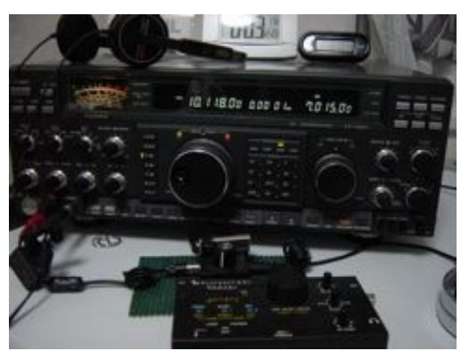
My shack in 2006