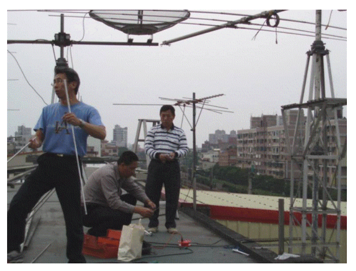
3. BV1EF (front), BX1AA and BV1EG (in the back). BV1EF and BV1EG are twins. Both are students.

1. BX1AA (in blue shirt), BX1AC (lower) and BX1AAB (standing)