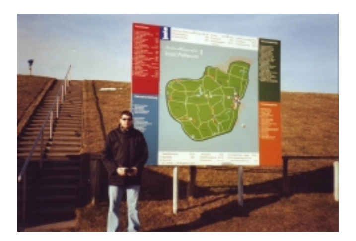
morsEAsia Page - 5 - April, 2006