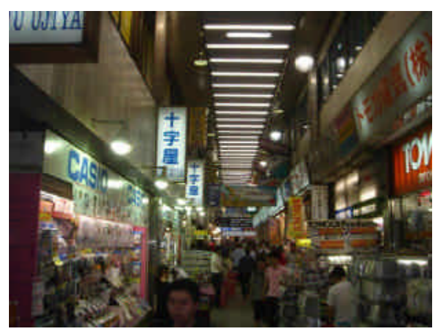
Evening in the Akihabara alleys, above.