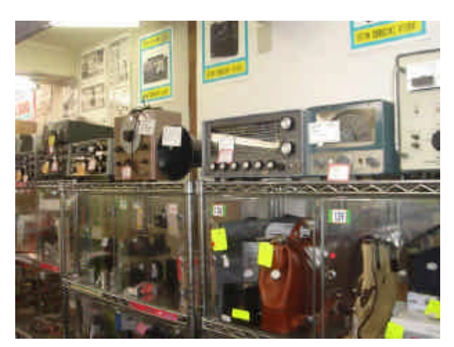
Old radios on sale, above.