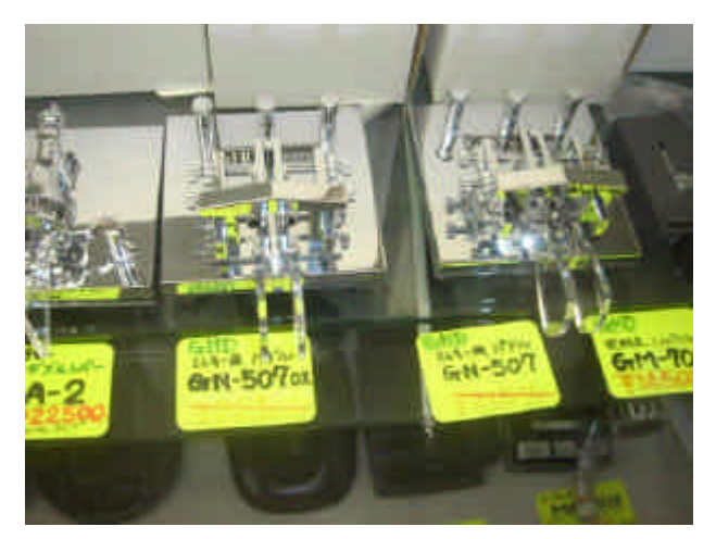
Some GHD paddles, above.