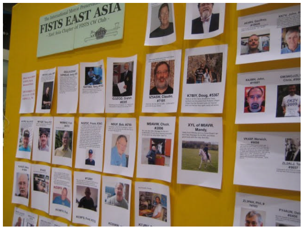
These messages were much helpful because we had no any good preparation

Japan Ham Fair was held on August 23 and 24. These are some photos at FEA booth. -- Ed.