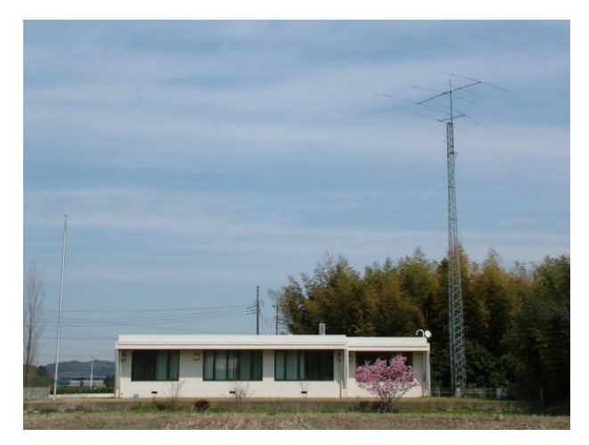
Mack's office and shack - and beam!