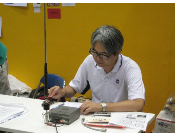
Sugi is acting a key-control of FEA-NET.