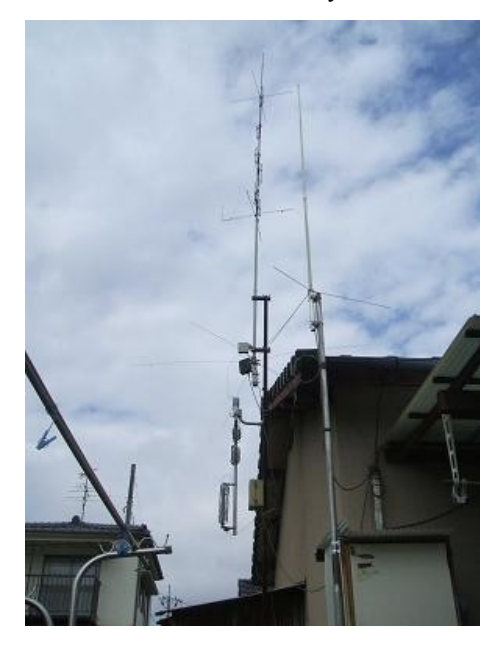
"UNFOGETTABLE QSO" BY NORI JR70EF

coils from a broken Butternut vertical and radial wires to the R7 to operate on 160 m and 80 m. That work as a GP with elevated radials. Because the elevated radials make a radiation angle low, I can enjoy low-band QSOs despite the small size of the antenna. I built a GP for 2 m lately. Therefore, the bands I can operate are from 160 m to 2 m now. But I feel the most important thing to enjoy QSO is not having multi bands system, but finding QSO partners on the bands. Let's on the air actively!