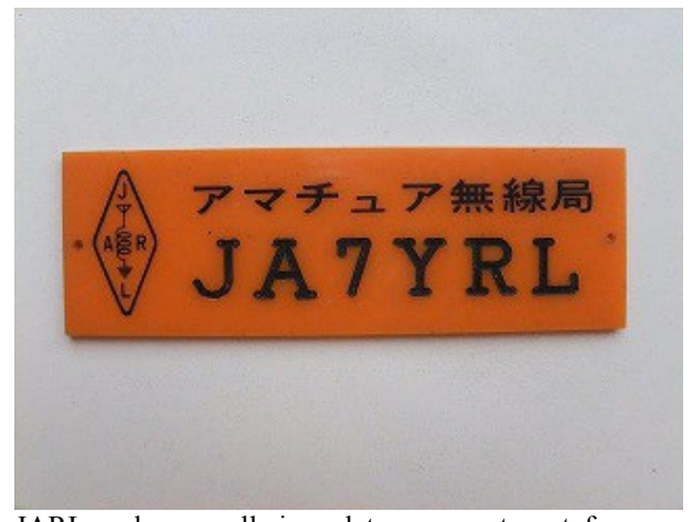
JARL makes a call-sign plate on a gatepost for new member. I have a treasure call-sign plate for JA7YRL. In the past, JA7YRL was not JARL station but club station of my high school.