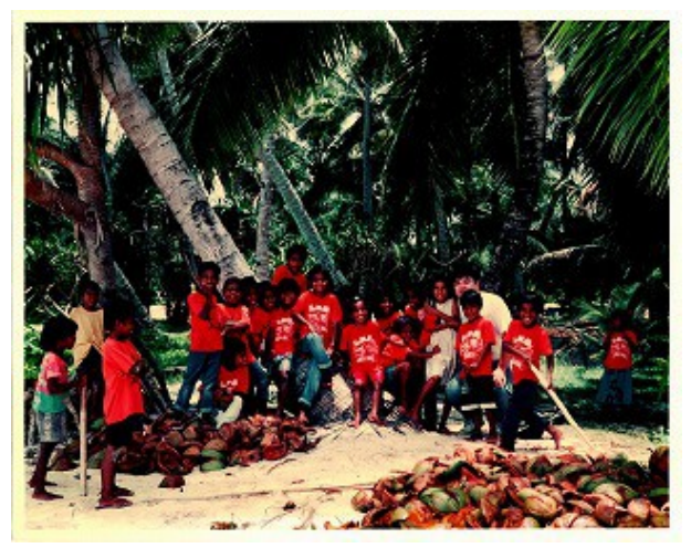
I worked V73JA in Majuro Rep. of Marshall Island on 1993 Sep. I took some pictures with kindly people.