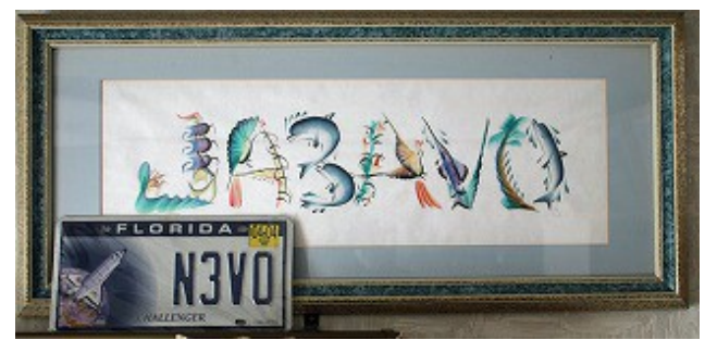
JA3AVO: Call designed by fish (Made in Universal studio, Orlando FL) N3VO: License plate of ex-N3VO