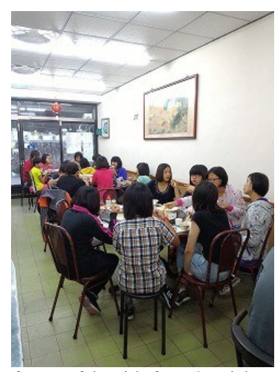
A picture of some of the girls from Onesiphorus enjoying a meal at the NanBei on a Saturday afternoon.

Every Saturday afternoon for around forty years a group of kids from the children's home enjoy a meal out at the 南北 餃子館, or the NanBei (South-North) Dumpling House. The family that runs this establishment has always been very generous to the children's home and concerned about the children in our care. Each Saturday they reserve a few tables and expect the bus to arrive with enough kids to fill the downstairs tables for an early dinner of pork dumplings, hot and sour soup, and a few other dishes. My wife and I used to accompany a group of kids each Saturday, and I fell in love with pork dumplings. When I was a young man and didn't have to worry about putting on weight, I could easily consume a few dozen of them without a second thought. Each person concocts his own mix of sauces to dip the dumplings in before placing them in his mouth; I prefer straight soy sauce and lots of black pepper, but many also add sesame oil, chili sauce, and lots of garlic.