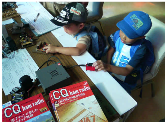
Two little boys enjoyed playing an electronic roulette game and a morse key!