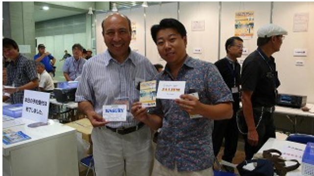
At the operations booth of 8J1A WA6URY and JA1JFM (20m CW operator of 8J1A) exchange QSL cards