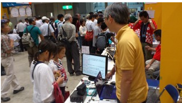
Young girls and JK7UST Sugi san