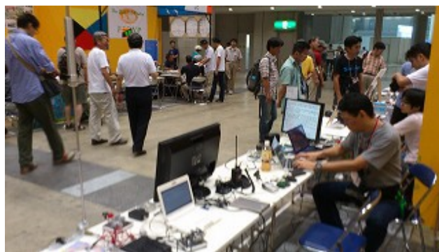
JQ1BWT Jun san checking the USTREAM server.